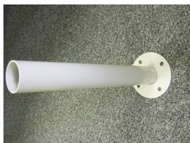
Wall or table bracket - Item No. 132050