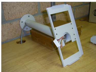
PayCon Plate - Item No. 132150