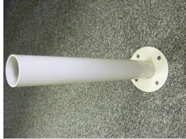
Wall or table bracket - Item No. 132050